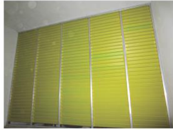
Eliminator & Louvers