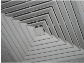
Diffuser & Grill