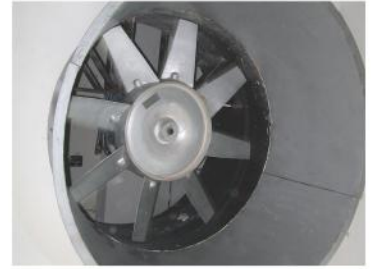
Axial Flow Fan