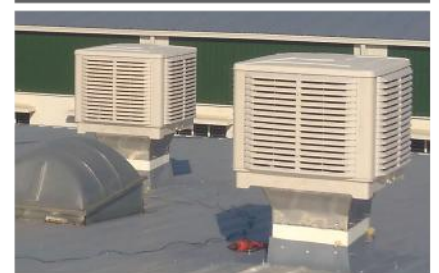
Roof Top - Down Discharge