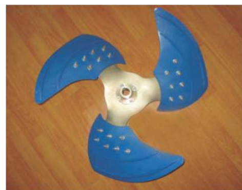
Cooler Axial Fan