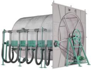
Rotary Drum Filter