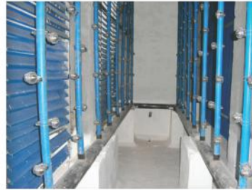
Air Washer Nozzle