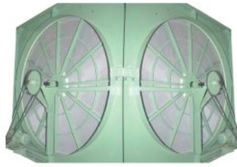
Primary Disc Filter