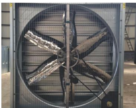
Wall Exhaust Fan Poultry